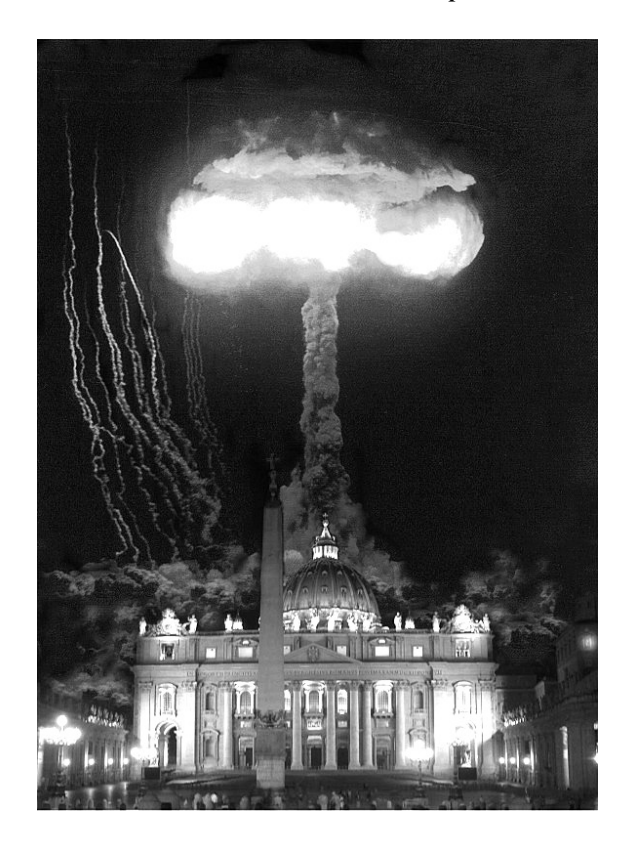
Was the threat of an atomic bomb on the Vatican used to force Siri off the Chair of Peter?

"But the new pope failed to appear. Questions began to arise whether the smoke was white or gray... By evening Vatican Radio announced that the results remained uncertain... But the reports had been valid. On the fourth ballot, according to FBI sources, Siri again obtained the necessary votes and was elected supreme pontiff. But the French cardinals annulled the results, claiming that the election would cause widespread riots and the assassination of several prominent bishops behind the Iron Curtain. [Department of State secret file, "Cardinal Siri," issue date: April 10, 1961, declassified: February 28, 1994.] The cardinals opted to elect Cardinal Frederico Tedeschini as a 'transitional pope,' but Tedeschini was too ill to accept the position. Finally, on the third day of balloting, Roncalli received the necessary support to become Pope John XXIII..." (Paul L. Williams, The Vatican Exposed , Prometheus Books, Amherst, NY, 2003, pages. 90-92)